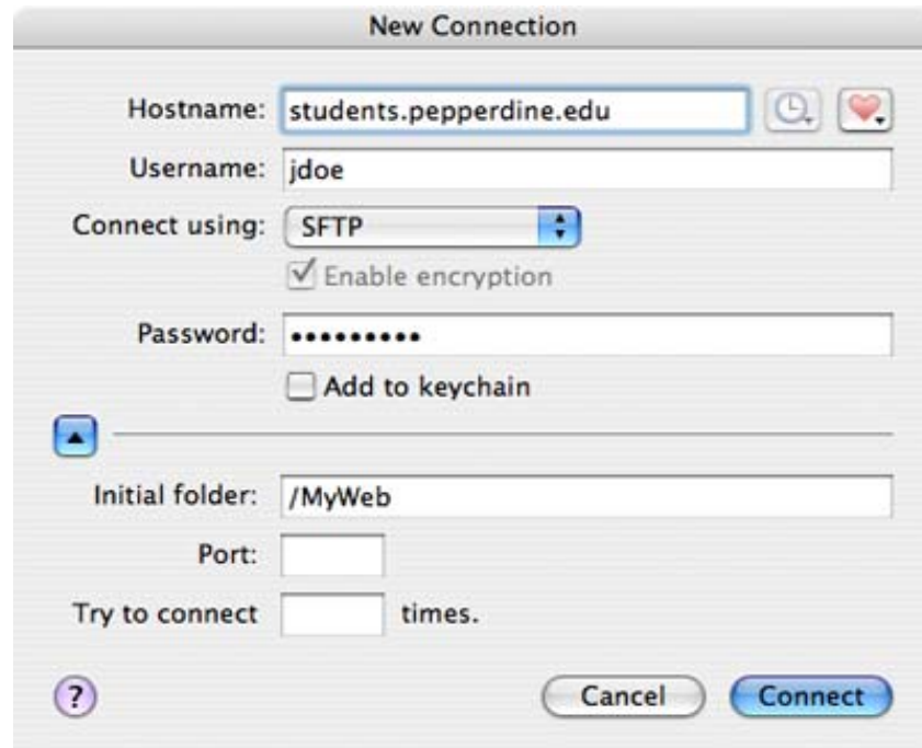
Figure 13: Configuring Fetch with your information