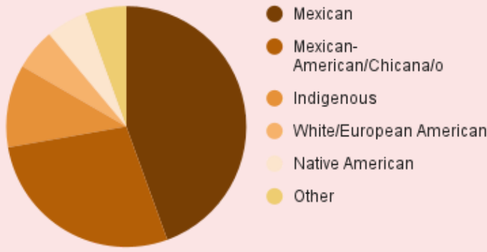
Student Ethnicities 2021-22