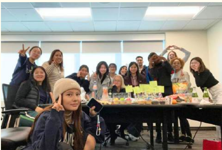
Sharing laughter, gratitude, and pumpkin pie—what a close-knit Friendsgiving crew!