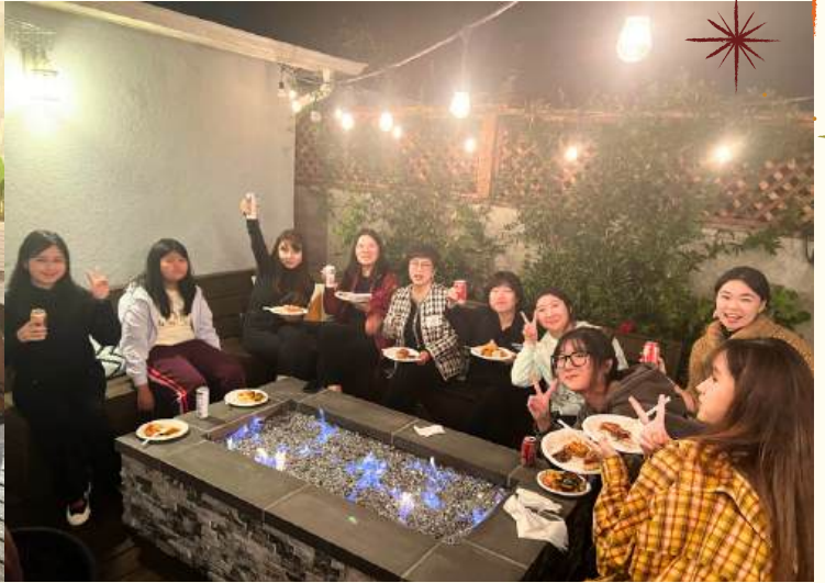
Thanksgiving with the Wongs! A day in the year when laughter and smiles light up the room—our favorite tradition!