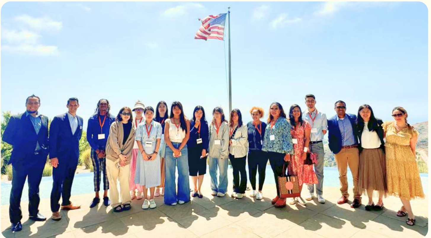
The Malibu Drescher Campus: the perfect backdrop for the start of the next chapter.