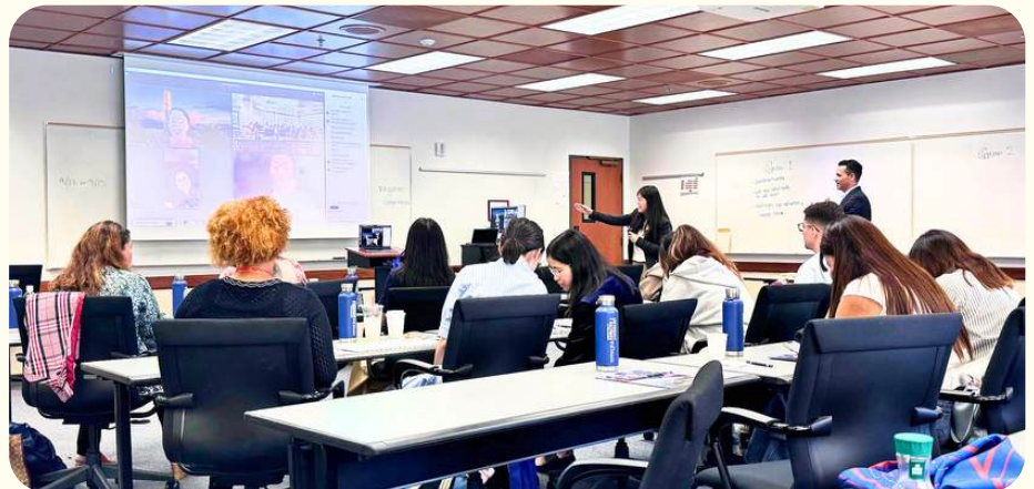
From cozy indoor sessions to vibrant outdoor adventures, we've got it all!