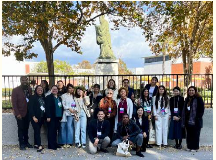
Joining forces at CATESOL—connections made, ideas shared, and fun had by all!