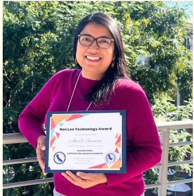
2024 Ron Lee Technology Award, CATESOL Education Foundation