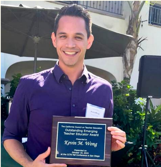
Outstanding Emerging Teacher Educator Award, California Council on Teacher Education