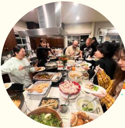
A feast of cultures, a celebration of unity