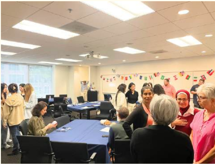
Diverse voices, shared stories, and unforgettable memories at the GSEP International Student Gathering.