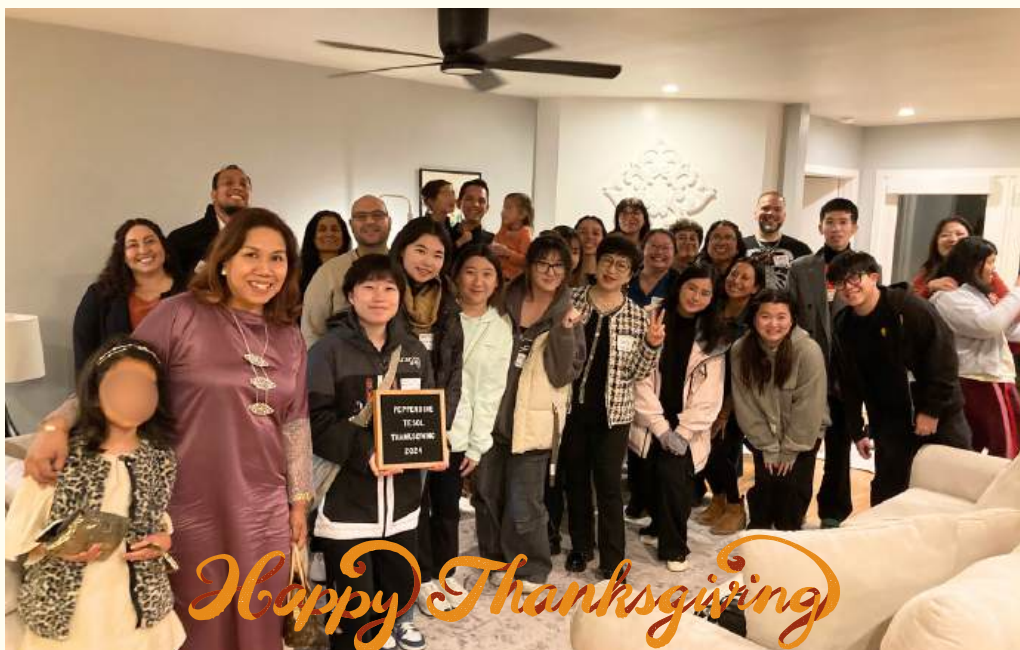
Thanksgiving finds its true meaning when we come together as one