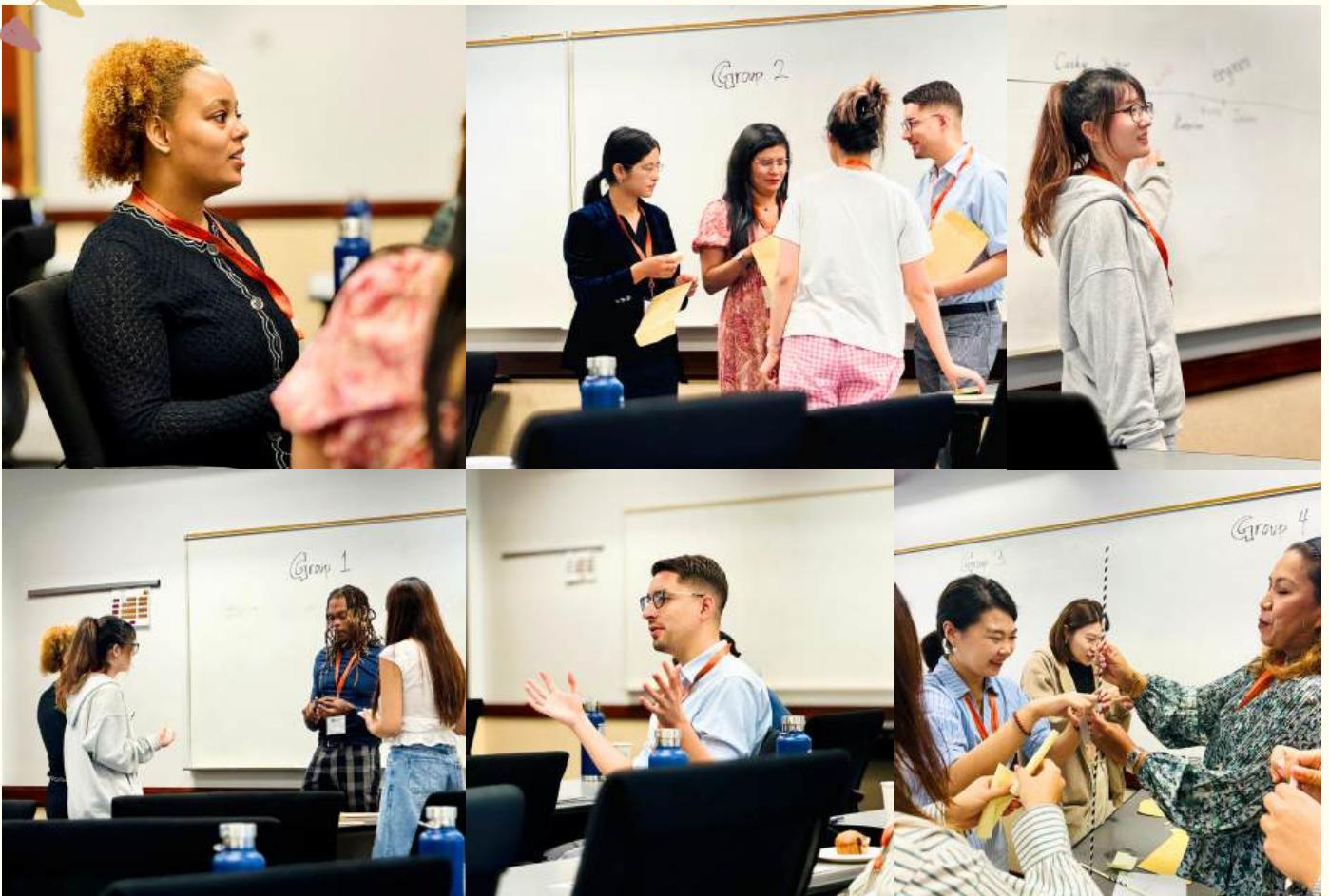
Communication sparks collaboration, and collaboration builds connection