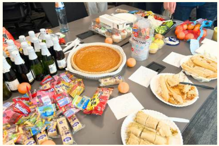
Food represented from multiple cultures and nations, representing the tapestry of our TESOL community.