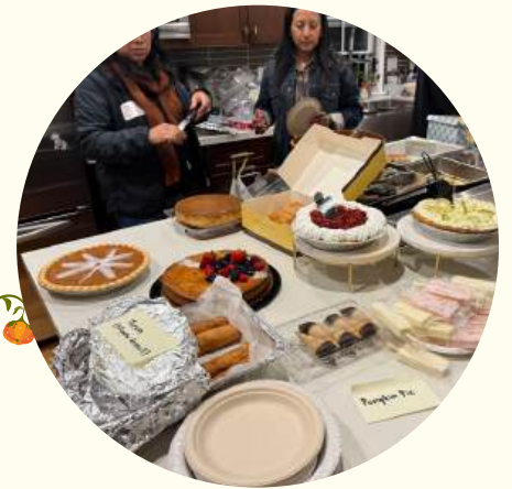
How can you miss dessert? It's the grand finale of any feast!