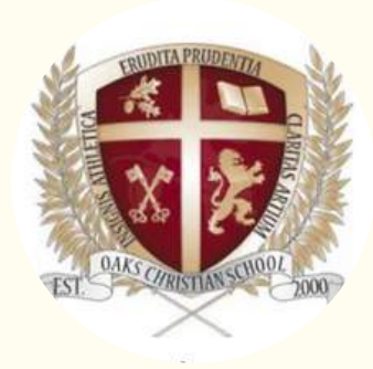
Oaks Christian Middle School