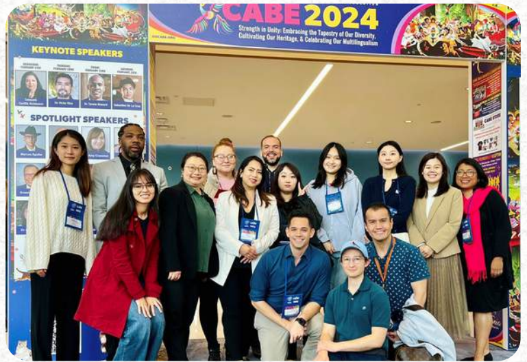
The One With Our Second Conference Near Disney