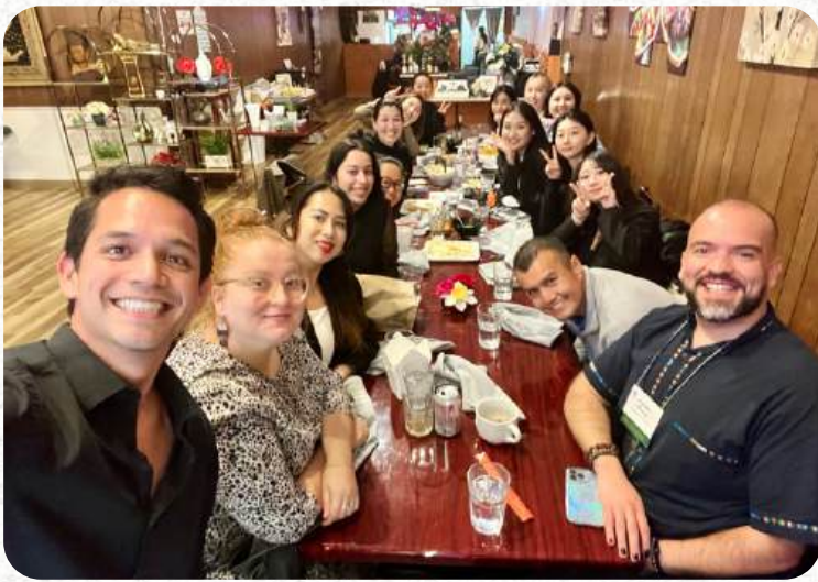
The One With Our First Post-Conference Dinner