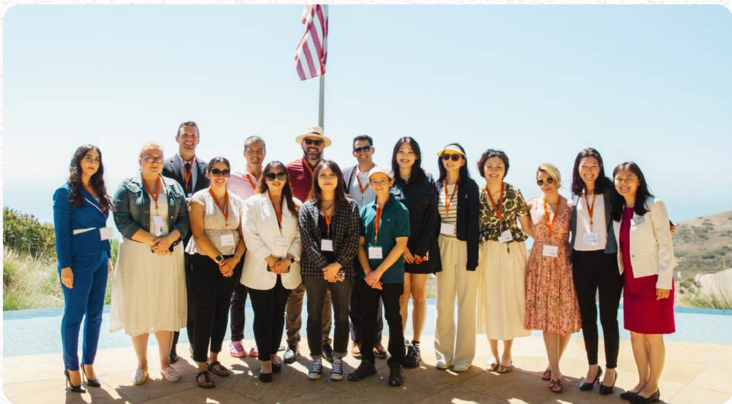
The One Where We First Met