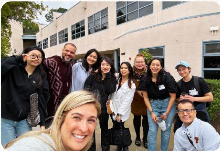
The One With a Site Visit