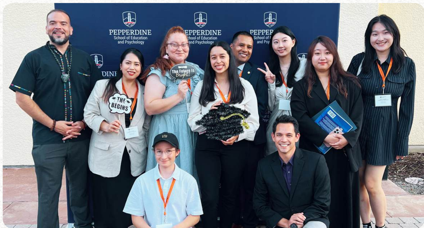
The One Where Our Chapter Ends