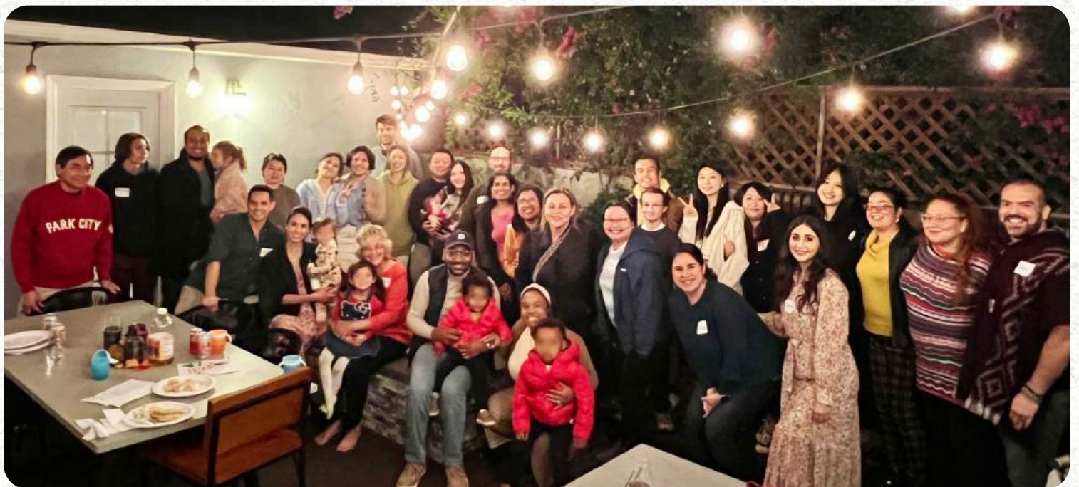
The One Where We Celebrated Thanksgiving Together