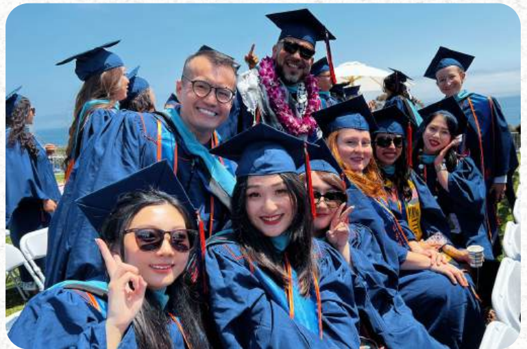
The One With the Graduation Commencement