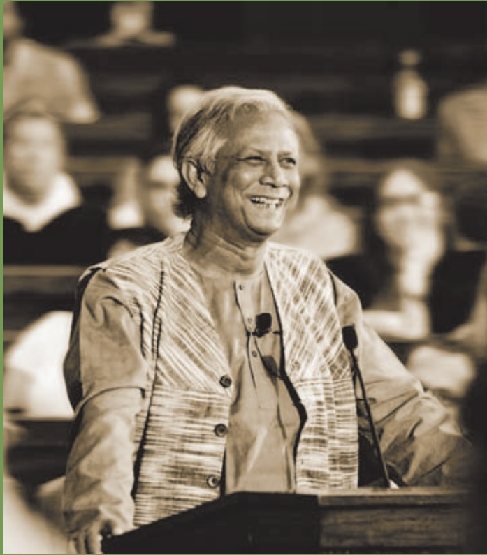
Dr. Muhammad Yunus , Nobel Laureate Social Entrepreneur of the Year Award Palmer Center at Pepperdine University School of Law, 2007